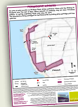
Permissive Access board