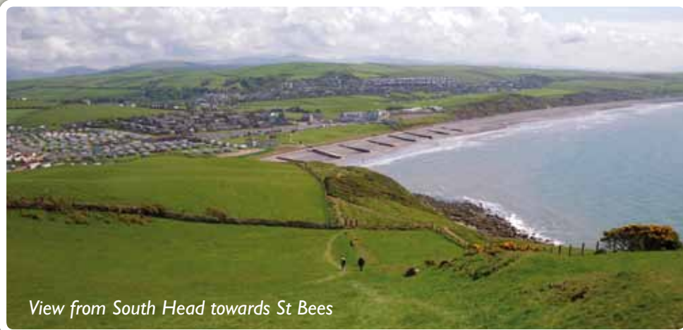
View from South Head towards St Bees