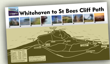
Bronze map panel

You are welcome to walk any of these Open Access areas or routes. The main coastal path is highlighted on the map along with Open Access areas and some of the permissive paths.