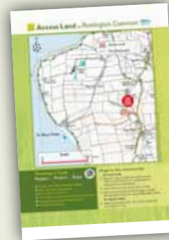
Open Access board

During your visit to this area you will come across a number of paths that will be way-marked either as 'Open Access', 'Public Footpath' or 'Permissive Footpath'. Some will also have map boards as pictured.