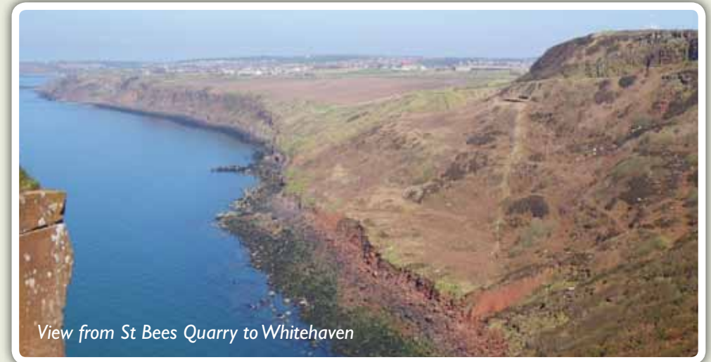
View from St Bees Quarry to Whitehaven