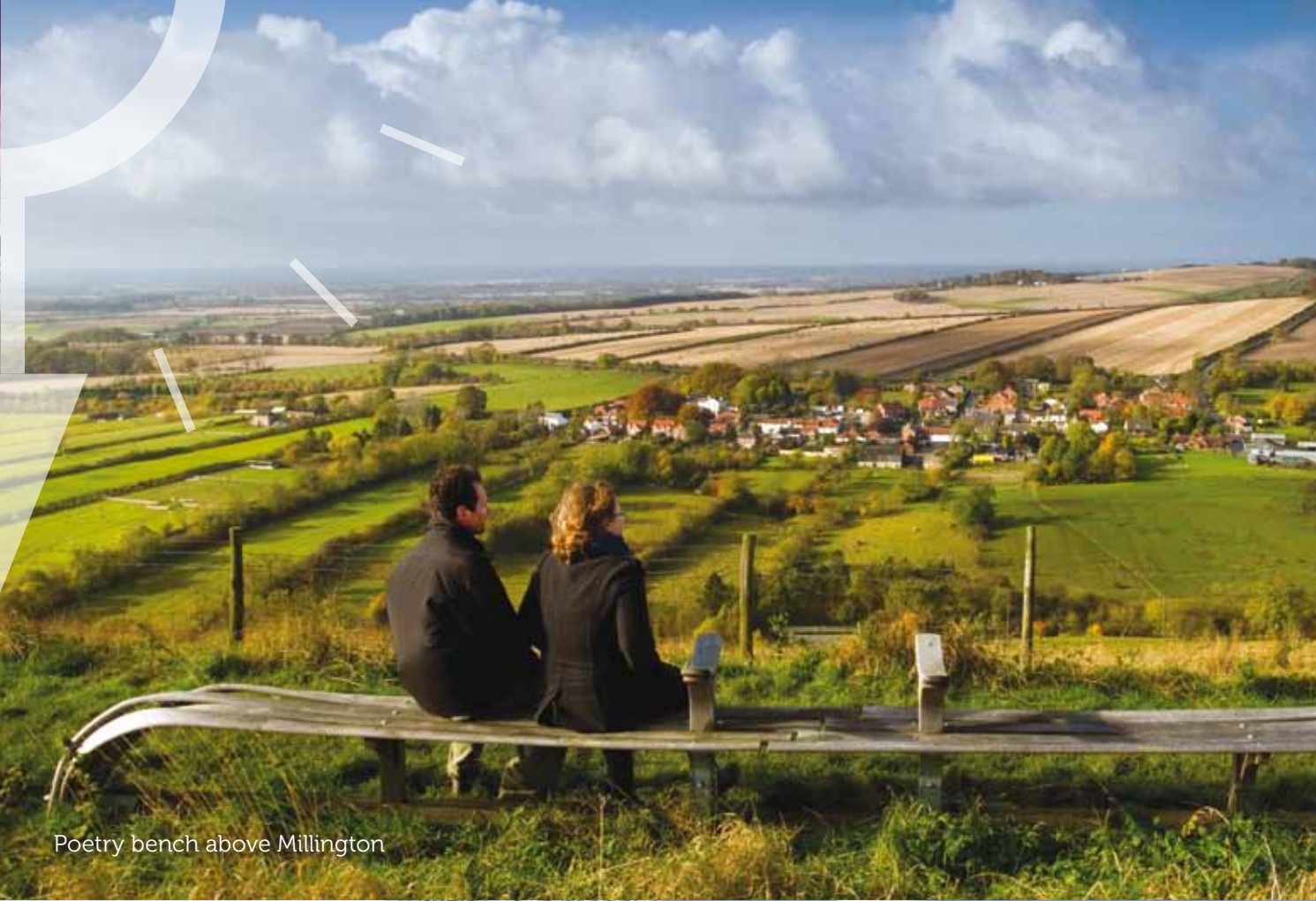
Poetry bench above Millington