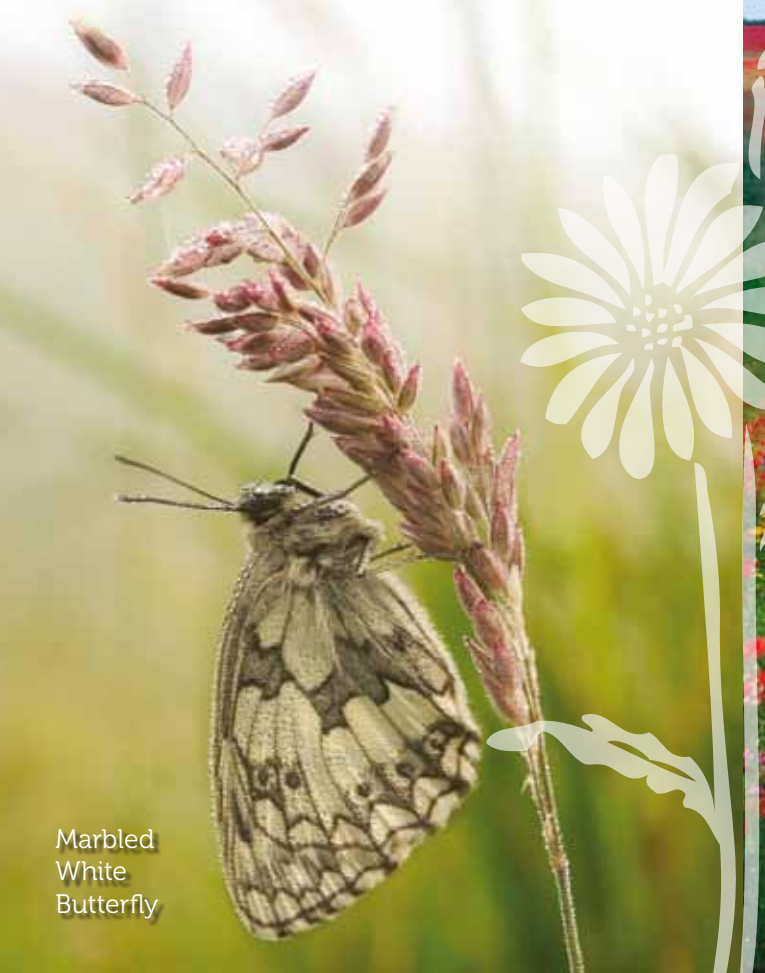
Marbled White Butterfly

79 miles of tranquillity on the beautiful Yorkshire Wolds